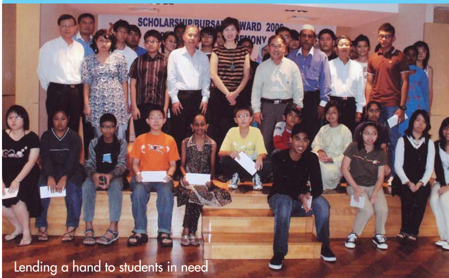
Lending a hand to students in need