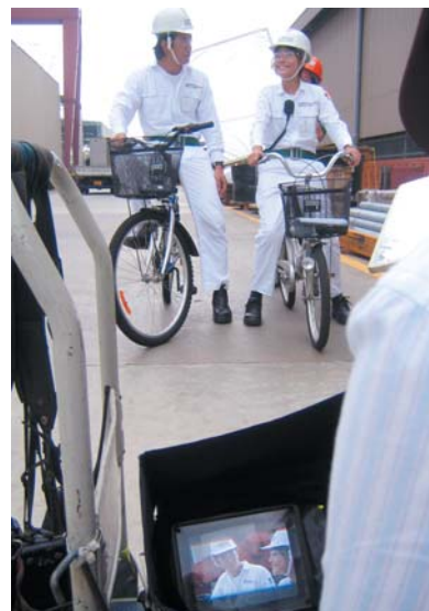
Keppel's reel heroes