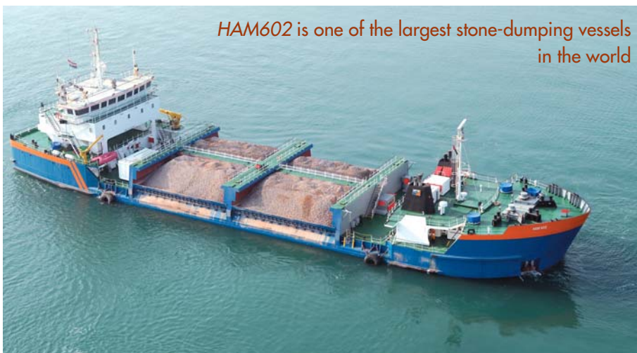
HAM602 is one of the largest stone-dumping vessels in the world

The slipways and the drydock were also kept busy the whole year as AHI repaired a total of 222 vessels in 2006. 141 vessels were repaired on the slipways, 33 in the 30,000 dwt Al Zora drydock and the remaining 48 were repaired afloat.