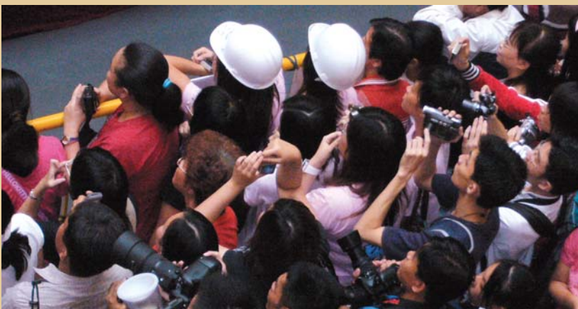
Shipyards gear can be sexy. Fans turn up in hardhats at the Hougang Mall Roadshow