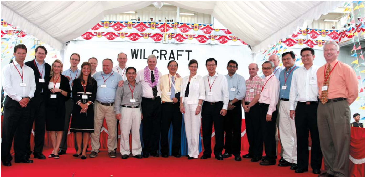
Celebrating the creation of a craft were key management from the Anders Wilhelmsen Group, Awilco, Premium Drilling and Keppel at the naming of the KFELS B Class jackup rig, WilCraft