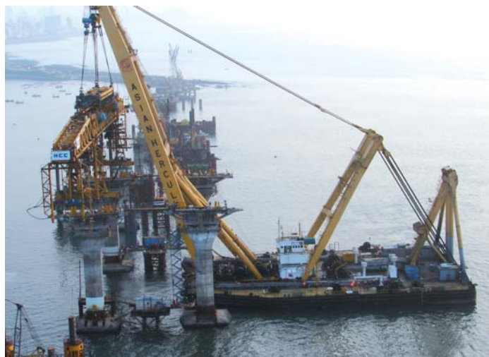
Asian Hercules hard at work on the Bandra Worli Sea Link