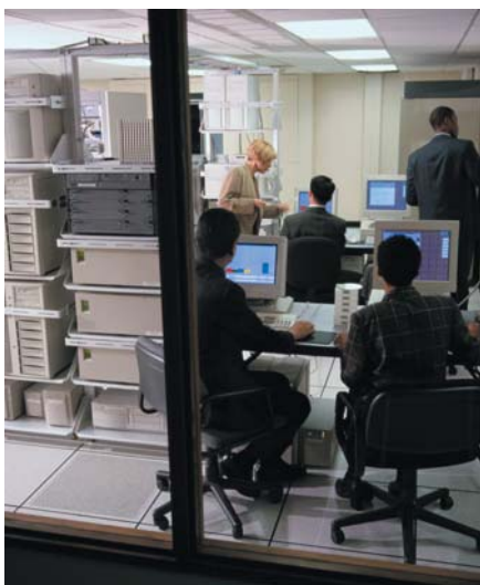
The combined strengths of PDC and Keppel T&T will provide an ideal platform for expanding Keppel's datacentre business in Europe