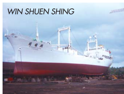
WIN SHUEN SHING