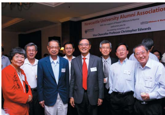
Catching up on the good ol' days