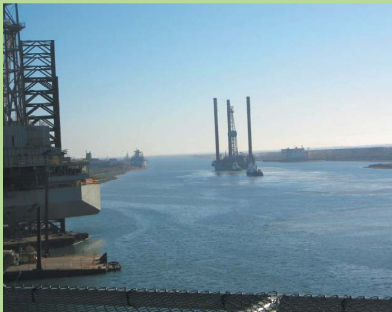
Pride Arkansas sailing back to work

Pride Arkansas returned to work on 17 February 2007 for Pemex in the Gulf of Mexico.