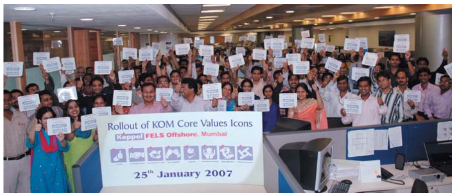
Staff at Keppel FELS Mumbai raising the Core Values

The icons also serve as a more effective