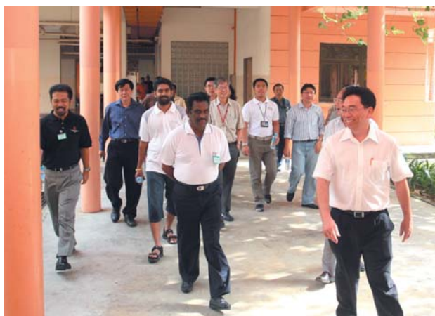
Residents' Committee members tour Acacia Lodge Page 28