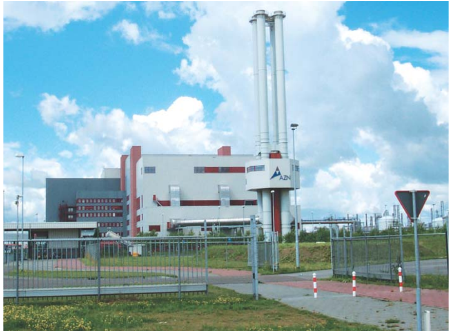
Keppel Seghers' Prism technology will raise the overall energy efficiency of the Moerdijk plant in the Netherlands

Keppel Telecommunications & Transportation (Keppel T&T) has acquired, through its wholly-owned subsidiary DataOne (Asia) (DataOne Asia), a 50% stake in the European datacenter operator, Premier Data Centres Limited (PDC). PDC was wholly-owned by Real Capital International Limited (RCI).