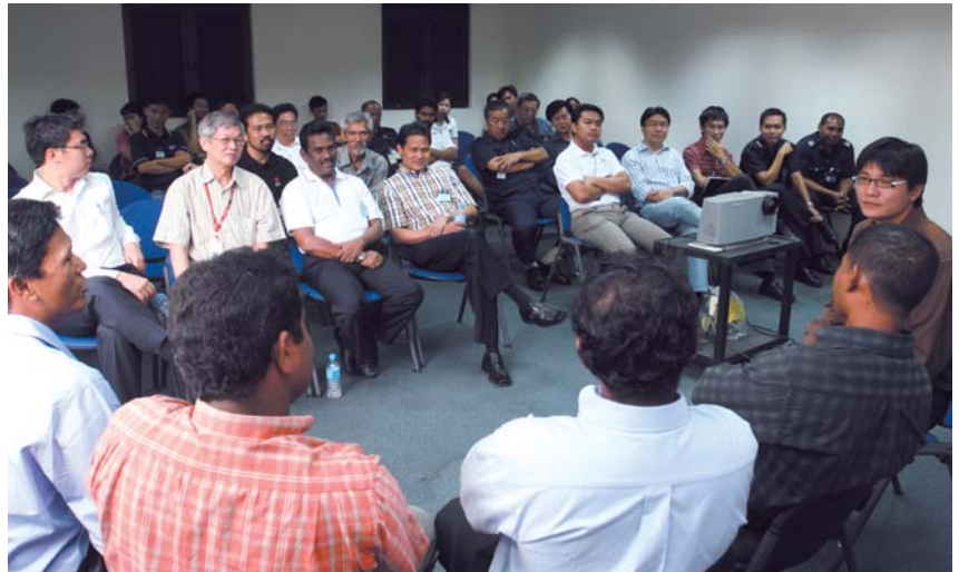
Sharing information and sharing lives – the guest workers talk about their lives at Acacia Lodge

Impressed by the interviewees, the RC members went away from the community outreach session satisfied that the residents of Acacia Lodge were well-disciplined and well-taken care of in the lodge.