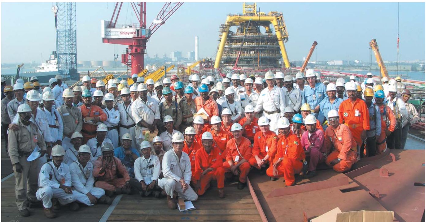
Key ingredient for zero accident on P-53 – teamwork

"Through training their workers, the senior management of the sub-contractors contributed to our safety milestone significantly."