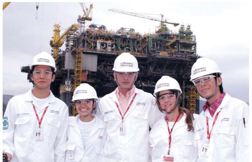
The P-52 semi props up many a scene