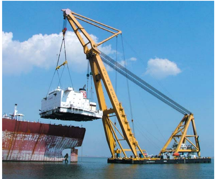
Asian Hercules lends a helping hand to the crew of P-53 by giving them a new home

Buoyed up by the strong offshore and marine market, Asian Lift is constantly on the move. Some of the numerous projects they have underway or completed recently include the lifting of modules for FPSO Kikeh at MMHE at Pasir Gudang, Malaysia; the lifting of turret and structures for FPU P-53 at Keppel Shipyard; offshore installation at the Jasmine Field Gulf of Thailand; offshore removal of redundant Jacket and Decks for BSP Brunie and the lifting of modules and turret for several FPSO projects at Keppel Shipyard.