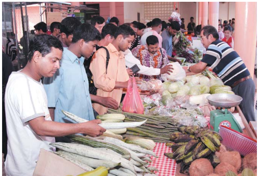
Guest workers have their own wet market at Acacia Lodge