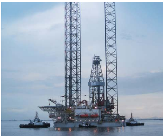
WilCraft completed in 23 months

Keppel Verolme at booth 2631 in the Dutch Pavilion