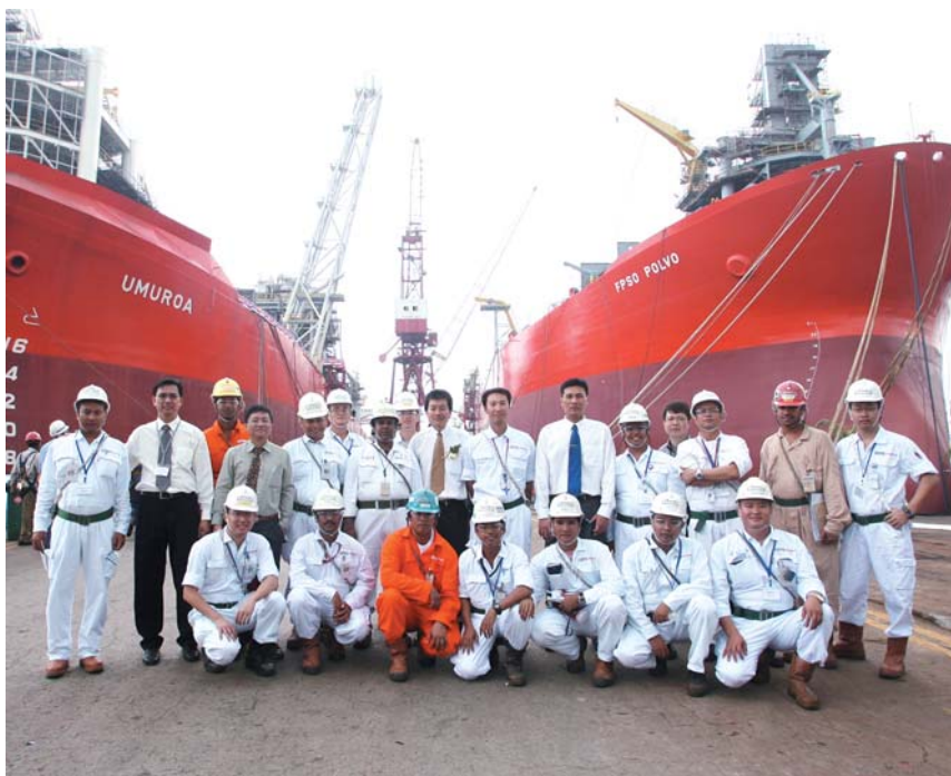
The project team of Umuroa celebrates its naming